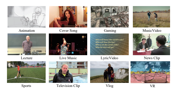
Figure 2. The thumbnail images of typical sequences in validation set.

The validation dataset consists of 562 videos (314,175 frames) taken from the UGC dataset [8]. The videos could be divided into 13 categories: Animation, Cover Song, Gaming, How To, Lecture, Live Music, Lyric Video, Music Video, News Clip, Sports, Television Clip, Vlog, and VR.